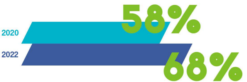
Percentage of proposals in applied research submitted by faculty

HKMU is expanding its research portfolio. Our new Research Impact Fund is tasked with identifying research areas of strategic importance for the future of Hong Kong and the region. The fund is currently channelling resources into nine transformational areas where HKMU aims to lead thinking and drive future action.