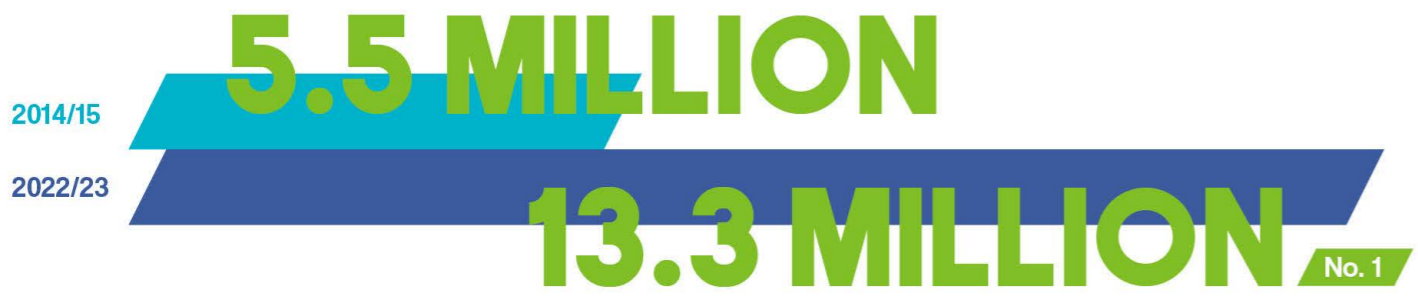
Faculty Development Scheme (FDS) funding

Good research needs good R&D infrastructure. HKMU has established seven R&D institutes/centres across the university, each with clearly defined goals and a highly focused research agenda. HKMU's primary focus is on applied research.